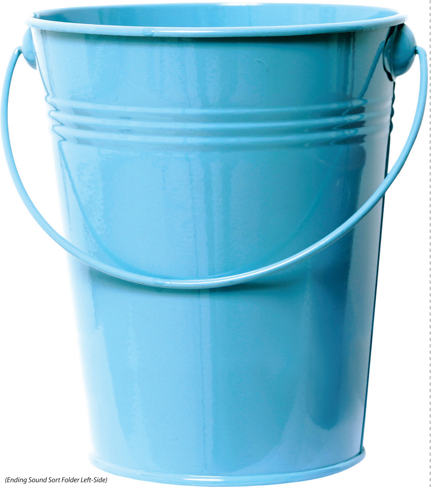
(Ending Sound Sort Folder Left-Side)