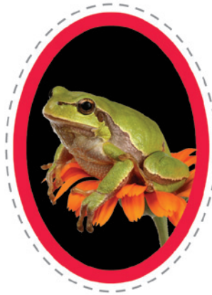
(Watermelon Seed Memory Cards)